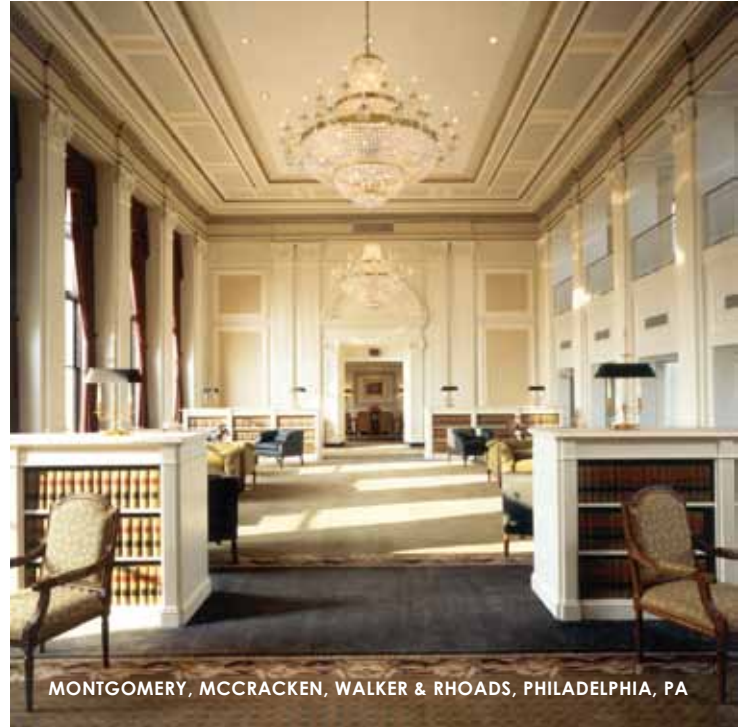
MONTGOMERY, MCCRACKEN, WALKER & RHOADS, PHILADELPHIA, PA

Wolf, Block Schorr & Solis-Cohen | PHILADELPHIA, PA; WILMINGTON, DE; PRINCETON, NJ