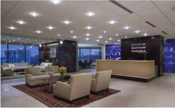
BROWN BROTHERS HARRIMAN GBCA Excellence in Craftsmanship | 2015