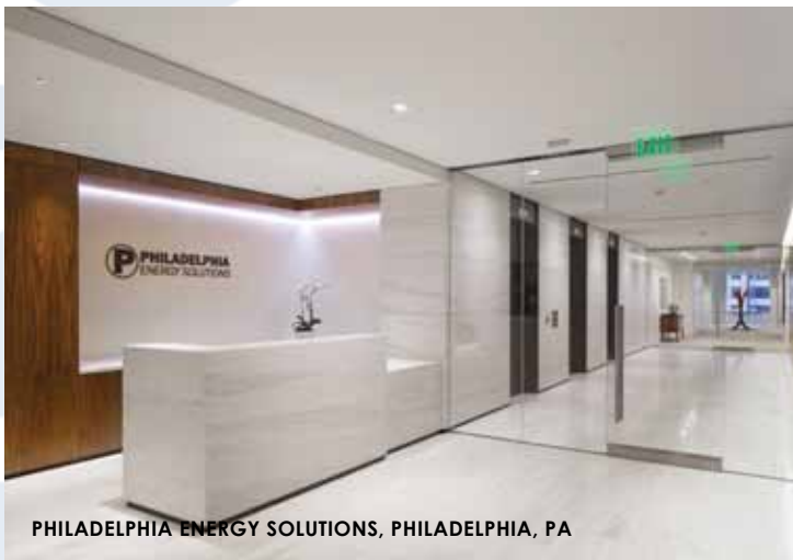
PHILADELPHIA ENERGY SOLUTIONS, PHILADELPHIA, PA