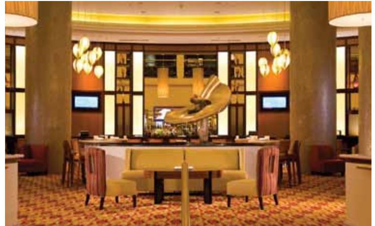
PHILADELPHIA MARRIOTT DOWNTOWN GBCA Best Commercial Project | 2008, 2011