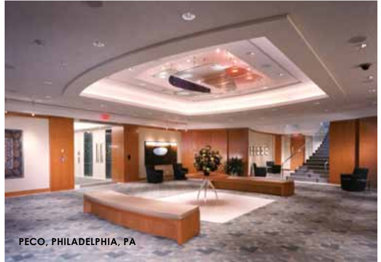
PECO, PHILADELPHIA, PA