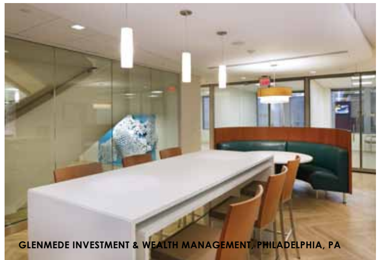
GLENMEDE INVESTMENT & WEALTH MANAGEMENT, PHILADELPHIA, PA