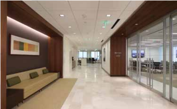
BALLARD SPAHR, LLP GBCA Excellence in Craftsmanship | 2014