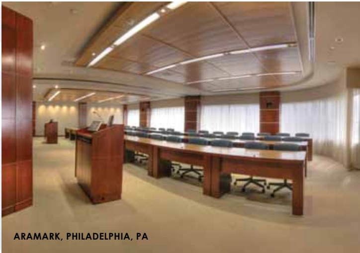
ARAMARK, PHILADELPHIA, PA

Glenmede Trust Co. | PHILADELPHIA, PA Greenwood Square Corporate Center | BENSLEM, PA Keystone Foods | CONSHOHOCKEN, PA Lafayette Place | NORRISTOWN, PA Monitoring Analytics | NORRISTOWN, PA National Board of Medical Examiners (NBME) | PHILADELPHIA, PA PECO | PHILADELPHIA, PA Pew Charitable Trusts | PHILADELPHIA, PA PNC Bank | BEAR, DE • PHILADELPHIA, PA • ALLENTOWN, PA Philadelphia Energy Solutions | PHILADELPHIA, PA PJM | VALLEY FORGE, PA RAIT Financial Trust | PHILADELPHIA, PA Rohm & Haas | PHILADELPHIA, PA Science Center | PHILADELPHIA, PA Sunoco | LESTER, PA • PHILADELPHIA, PA • MARCUS HOOK, PA T-Mobile | NORRISTOWN, PA • WAYNE, NJ William Penn Foundation | PHILADELPHIA, PA