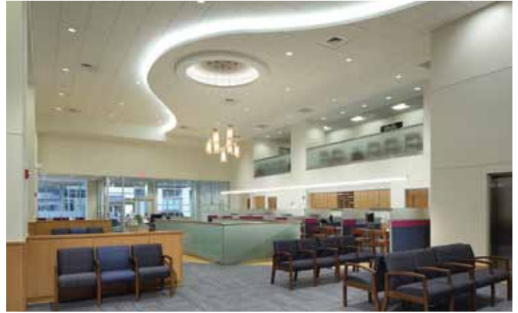
TJU HOSPITAL, OBGYN CLINIC GBCA Excellence in Craftsmanship | 2014 CREW Philadelphia Community Impact Award | 2014