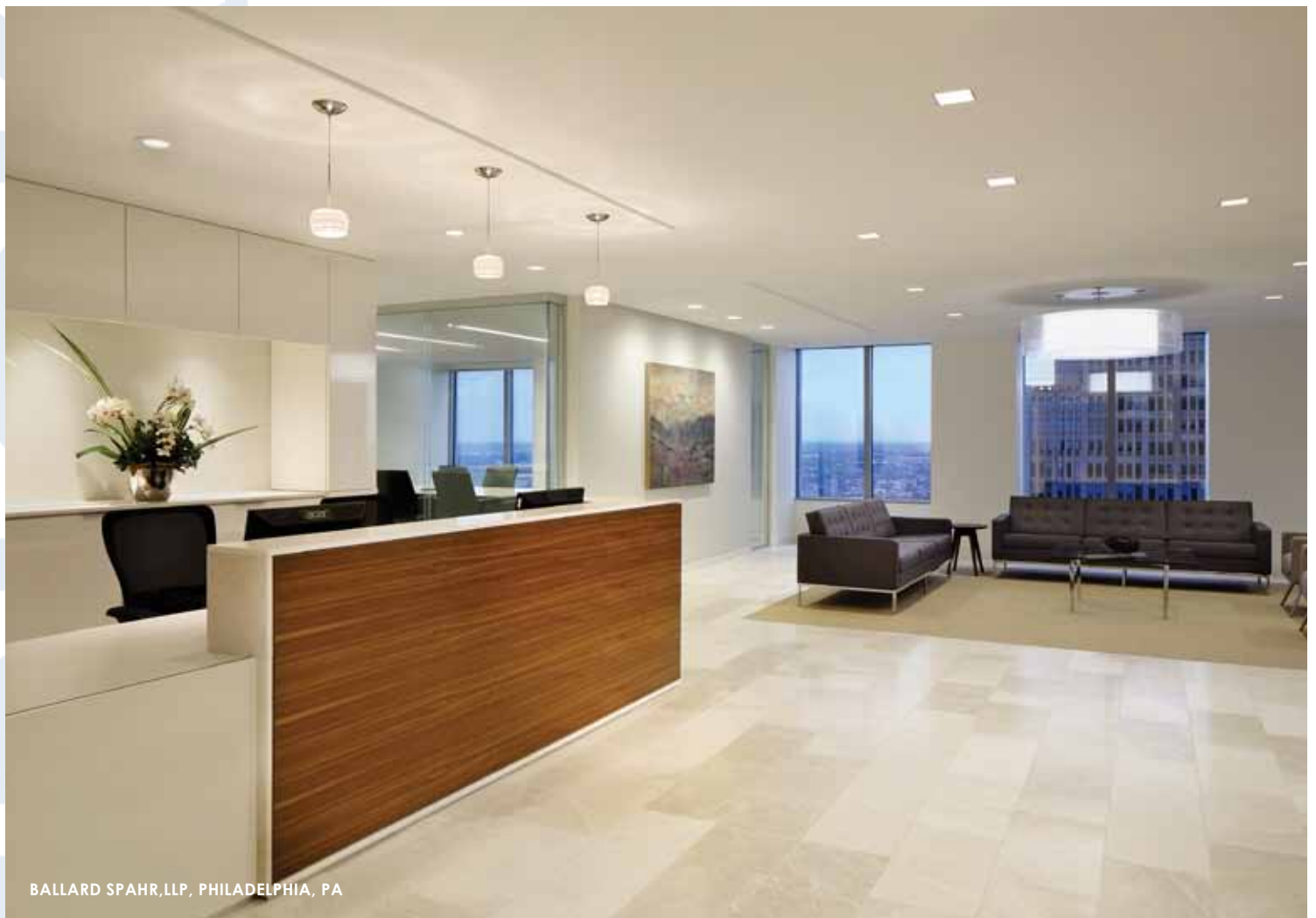
BALLARD SPAHR, LLP, PHILADELPHIA, PA